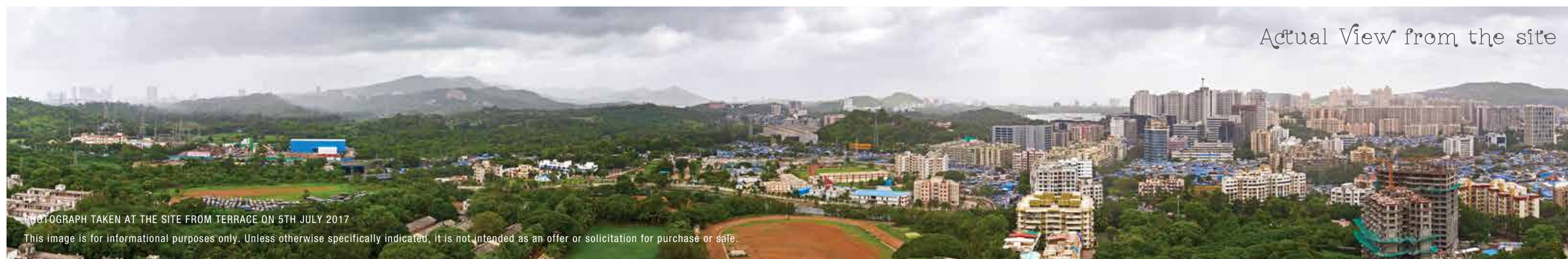
Actual View from the site

PHOTOGRAPH TAKEN AT THE SITE FROM TERRACE ON 5TH JULY 2017